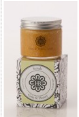
Star Item - Grits & Honey Scrub