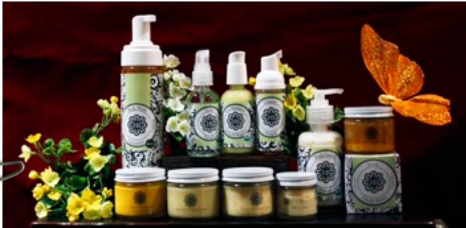
Hollybeth's Natural Luxury range of products