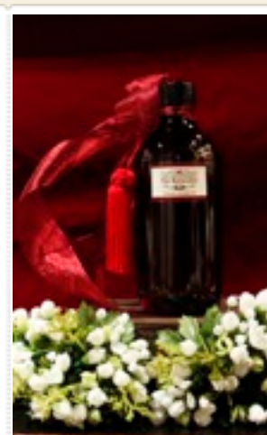
Massage oils blended to your needs