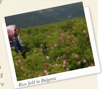
Rose field in Bulgaria

The flowers must be promptly transported to the distillery. Once delivered to the distillery, the petals are scheduled for processing into various rose oil and water products. Rose oil is produced by a two-stage distillation process. It is a common practice to re-distill the distilled water, a process known as cohobation.