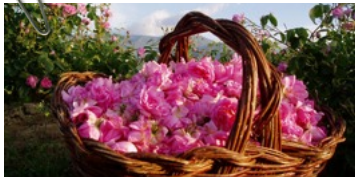
Harvested Rosa damascena ready for distillation