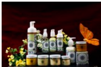
Hollybeth's Natural Luxury