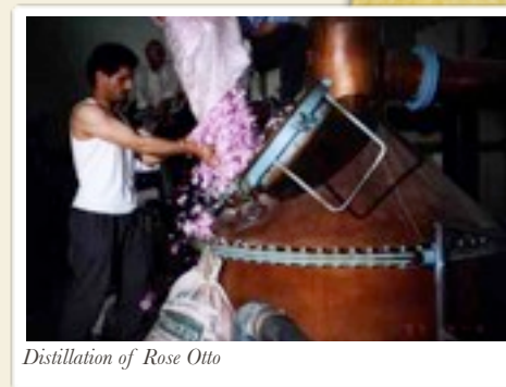
Distillation of Rose Otto

Please feel free to contact us for more details.